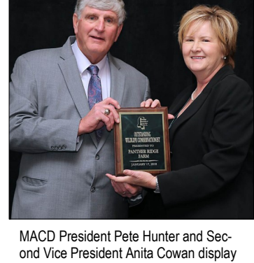
the Outstanding Wildlife Conservationist Award won by Panther Ridge Farm.